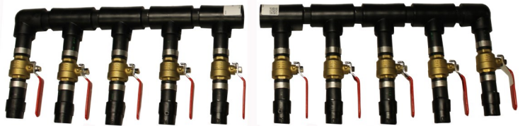
Inside Manifolds (Non-Insulated HDPE) - $25.00 Discount Per Pair Call For Custom Part# For Your Application