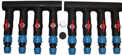
Inside Manifolds (Insulated PVC) - $25.00 Discount Per Pair Call For Custom Part# For Your Application