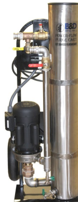
Flush Cart - $100.00 Discount B&D Part# GT304SS2 (SS FLUSH CART 2HP)