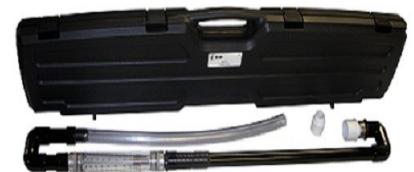
Flow Meter Tool - $25.00 Discount B&D Part# 1WFT17 (2-20 GPM FLOW METER TOOL - CASE INCLUDED)