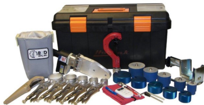
Socket Fusion Kits - $100.00 Off Each Kit B&D Part# R63-46C-1K (3/4" & 1 1/4" Kit) B&D Part# R63-48C-1K (3/4" Thru 2" Kit)