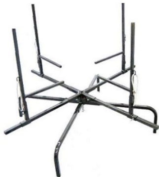
Poly Pipe Roller - $50.00 Discount B&D Part# WPR (POLY PIPE ROLLER)