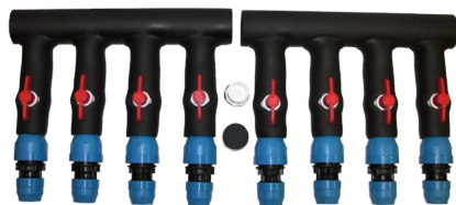
Insulated PVC Style

B&D MFG., Inc. offers in-house custom insulated PVC as well as HDPE manifolds.