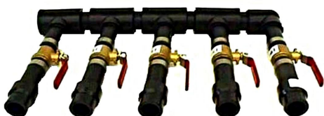
HDPE Manifold with Brass Ball Valves